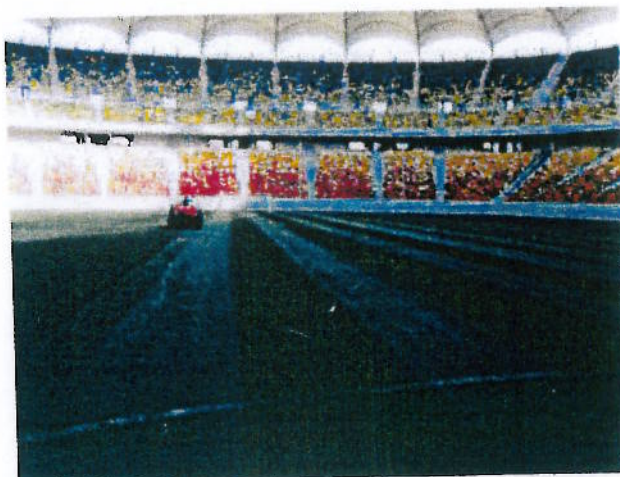
Fig 1 General view of pitch

The grass sward reviewed on site was a mixture of Poa Pratensis and Perennial Ryegrass. Grass cover was between 80 and 90 percent in most areas including the shaded end of the stadium. The grass presented was very lush, dark green in colour and presented rooting within the top 25-35 mm only. Significant bare patches were present where the turf had sheared at the match.