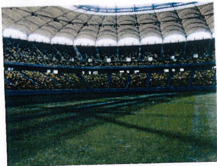
Fig 9 Shading in stadium

The spectacular stadium architecture of the building does not take account of grass growth and seriously limits air flow and sunlight on to the pitch. It was confirmed at the meeting that consideration or modelling for pitch conditions was not carried out for the local climate in Bucharest and that a replica of a pitch in Frankfurt was installed. The central tower holding the TV screens combined with the steep tribunes of the stadium mean sunlight only penetrates a small amount of the pitch area.