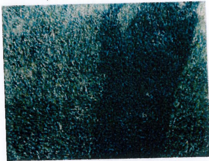
Fig 2 Close up of full grass cover area