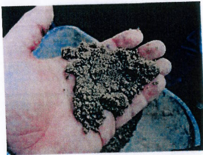
Fig 6 coarseness of sand material used to build the pitch