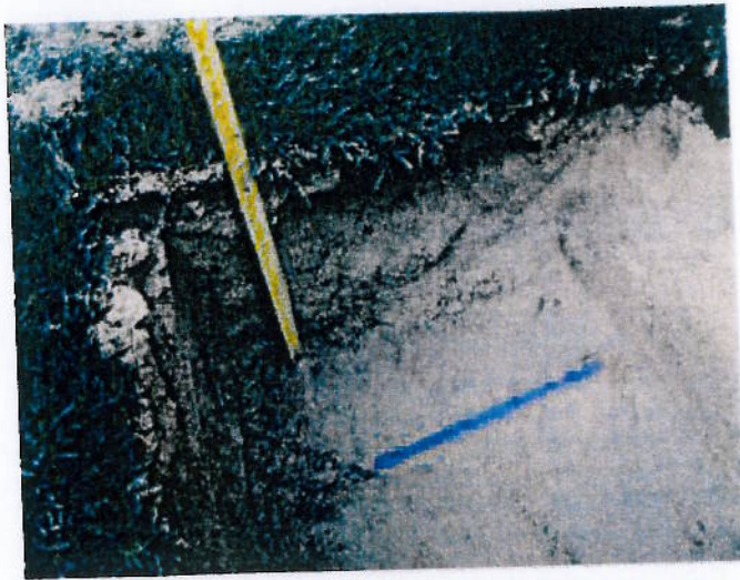
Fig 5 Soil profile showing sand