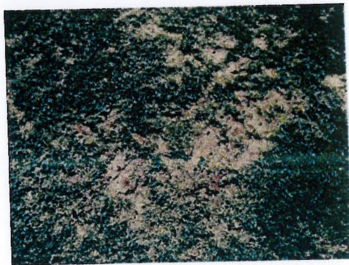
Fig 3 Close up of scuffed area with 20% grass cover