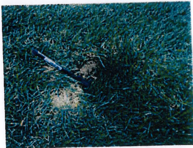
Fig 7 Divot depth of 60 mm and movement of turf and underlying soil when pressure applied by shoe heel