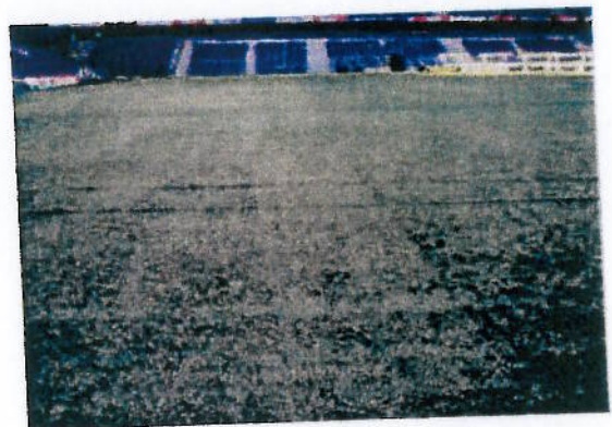
Fig 12 and 13 November 5 th 2010 first game after pitch replacement and after usage in January 2011 after the cold, shade and fixtures damaged the grass