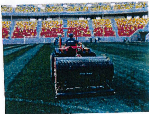
Fig 11 Vertidrainning

Some mowers were viewed on site including a ride on Toro triplex and a large Allett pedestrian mower. The rest of the equipment is supplied on contract as and when needed as are staff. There wasn't a definitive "groundsman" on site, rather a contractor and consultant. Fertilisers and chemicals are brought in when needed. The aeration activity being carried out on the pitch was adding to surface instability and making the surface so soft it was barely walkable. Hence a recommendation to stop this activity was made although 50% of the pitch had received treatment by the time of the visit.