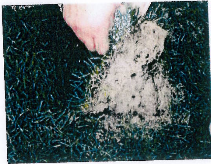
Fig 4 Grass rooting